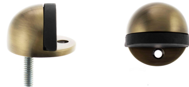
Product Finish Pictured: Antique Brass